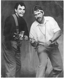
GRIZZLY FRANK & GLAD HAND CANOE